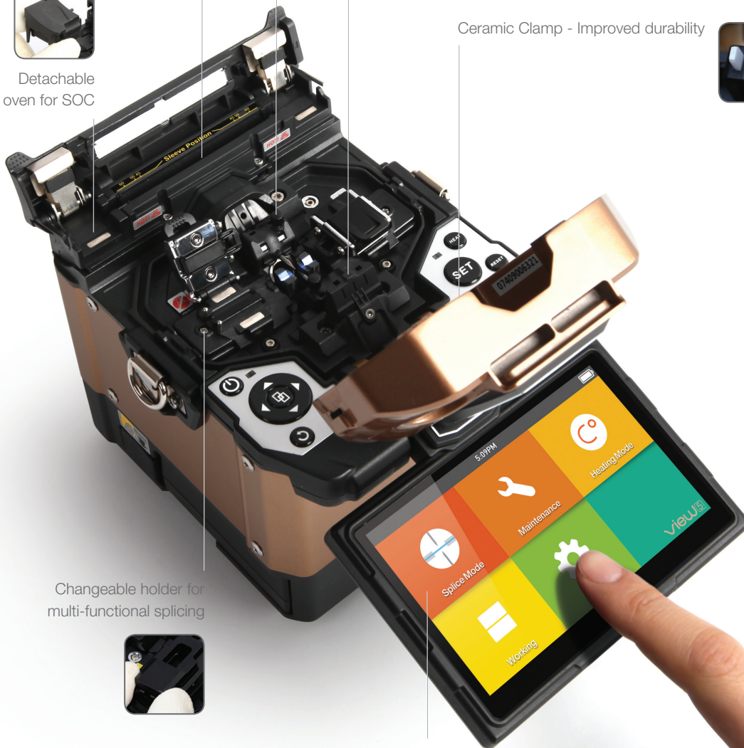
Changeable holder for multi-functional splicing